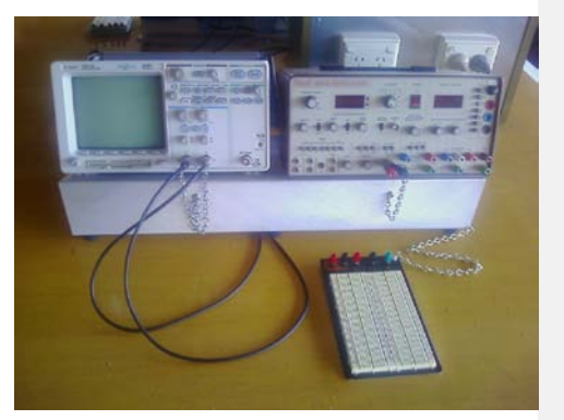
Figure 2 – Equipment supplied for the Active Network Synthesis experiment

The students are provided with the following instruments and equipment: A function generator, power supply, dual trace oscilloscope and a breadboard (figure 2)